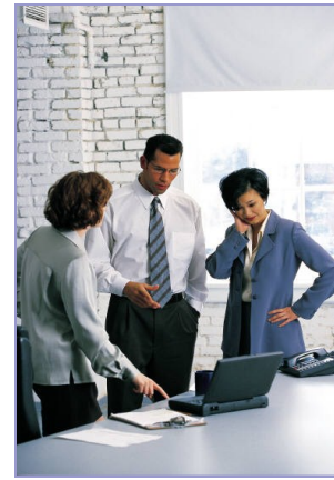
IAAP provides resources to meet needs and challenges facing administrative staff, today and tomorrow.

IAAP can become your partner in leading your administrative professionals toward achieving excellence. We provide resources to meet the needs and challenges facing the administrative staff, today and tomorrow. IAAP members receive the tools and knowledge necessary to become more effective contributors to their employers. By reading IAAP publications and attending IAAP educational events, members stay on top of their profession.