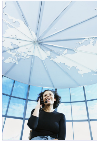
IAAP has members all over the world, even overseas.

Many corporations, educational institutions, students, and international affiliate organizations also belong to IAAP.